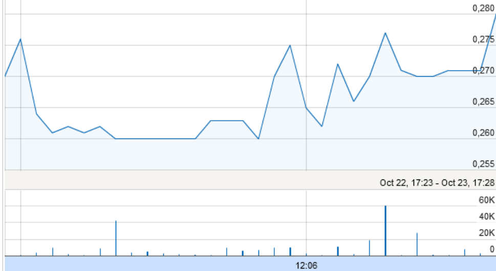
chart by amCharts.com